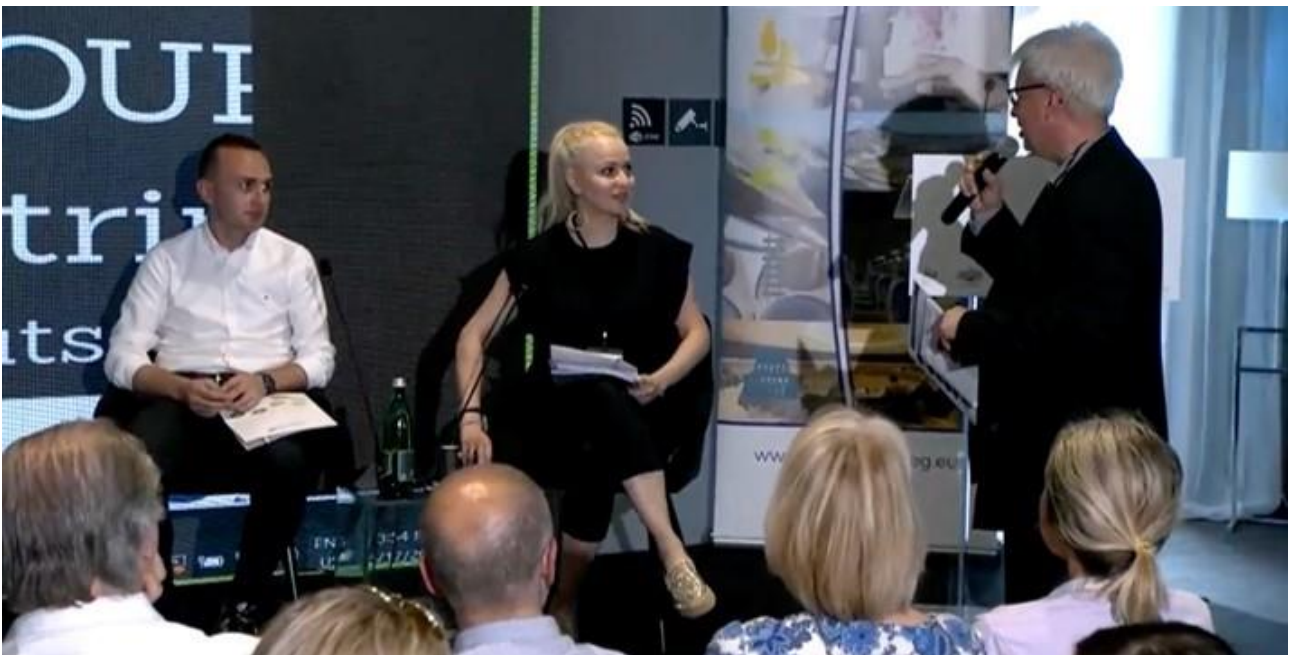
Figure 2: SUSTOURISMO project representatives in the ADRION annual event, 2022.

On 17 May 2022, SUSTOURISMO project was presented during the ADRION annual event that took place within the occasion of the 7th Forum of the EU Strategy for the Adriatic and Ionian Region (EUSAIR) in Tirana (Albania). SUSTOURISMO representatives joined the ‘Panel on Smart and sustainable mobility of Interreg ADRION’s contribution to the EU Green Deal: Experiences of renewables & Energy efficiency and green mobility practices in the Adriatic-Ionian area’ and discussed on the next steps of ADRION connectivity and sustainability. The panel gathered representatives of projects as Inter-Connect (PLUS), TRIBUTE, ENERMOB, and SUSTOURISMO, all co-funded within the Interreg ADRION Programme.