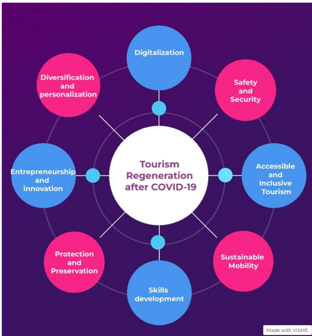
Figure 3: Priorities for tourism regeneration after COVID-19 as derived by the sub-cluster Policy Paper

For further information, policy paper can be downloaded following the link: