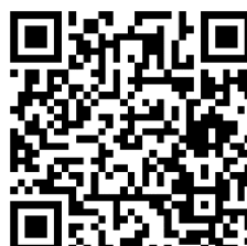
QR codes for Android and for iOS